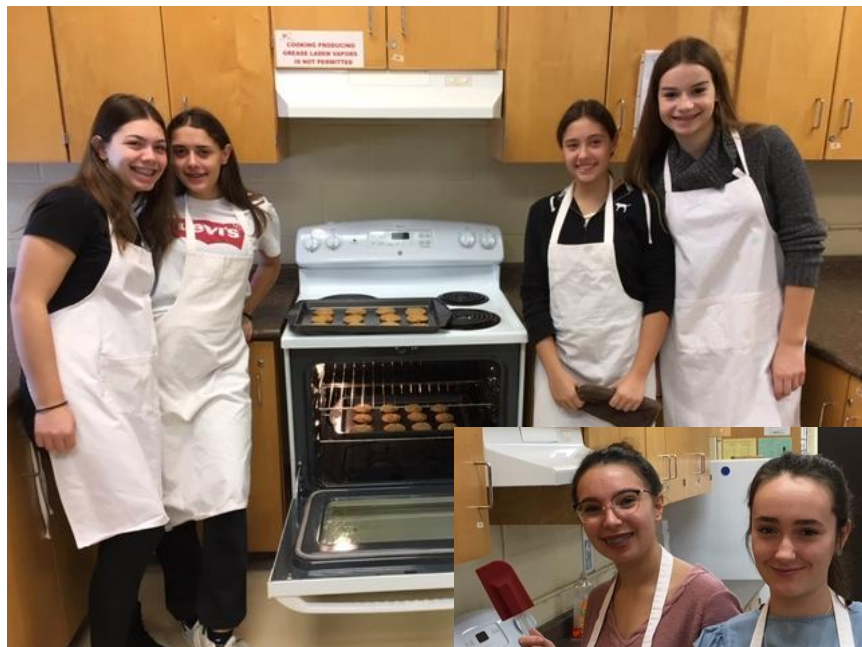
Gr. 9 Exploring Family Studies students showing off their skills in the kitchen!