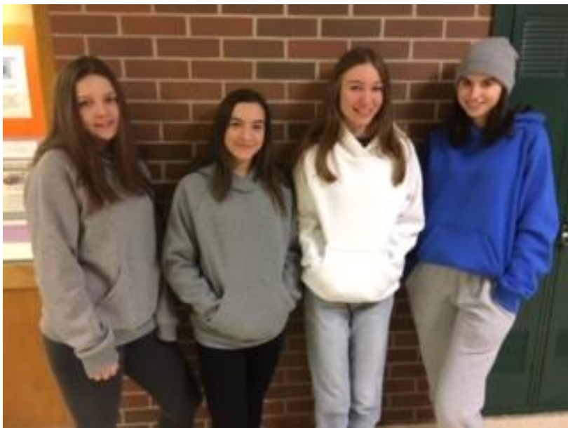
Gr.11 Fashion students showing off their new hoodies!. Great work!